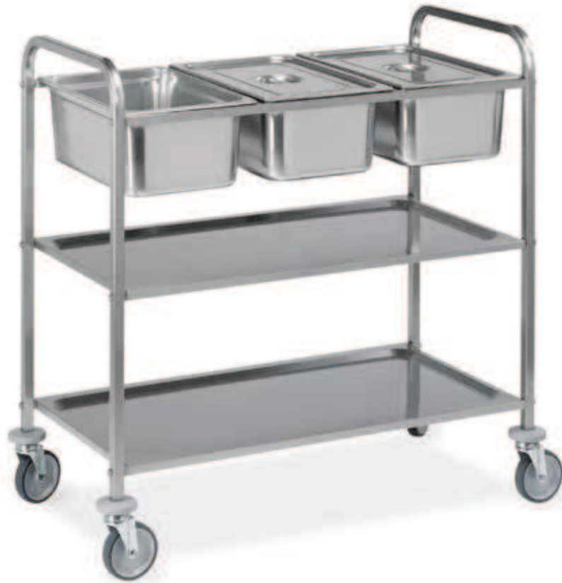
Item 1552 + pans