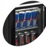
Designed for Energy-cans