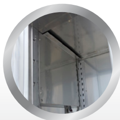
notranji uparjalnik internal vaporizer