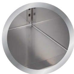
zaobljeni vogali rounded corners