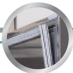
zamenljiva guma replaceable door gasket