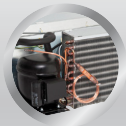
zamenljiv agregat removable refrigerating unit